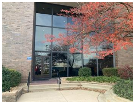
Entrance to the building

The Quilted Fox is a great independent quilt store located at 2055 Craigshire Rd, Suite 205, St. Louis, MO 63146 (314) 993-1181. They are open M-Sat 10am-4pm. The website is: quiltedfox.com . Don't be fooled by the outside that looks like an office building, the first picture is